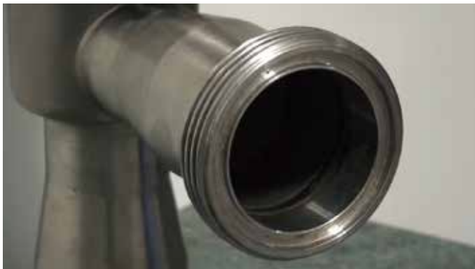
Normal View Item looks clean and normal under white light or standard UV

Industry compliant Bactiscan™ conforms to GMP and CIP requirements with an IP67 rating and is drop test certified to 1.5 meters.