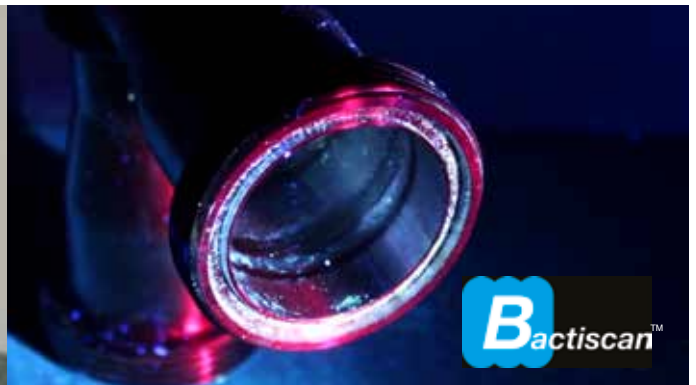
Bactiscan™ View Clearly reveals contamination